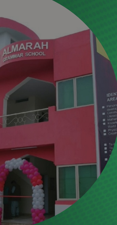
ALMARAH GRAMMAR SCHOOL