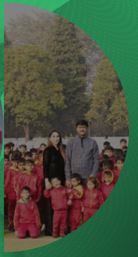
EXTRA CURRICULAR ACTIVITIES