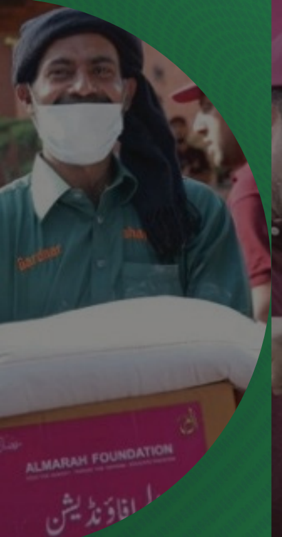
ORPHAN FAMILY SUPPORT