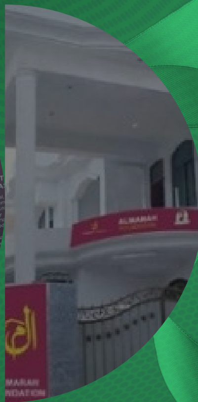
APNA GHAR CHILDREN'S HOMES